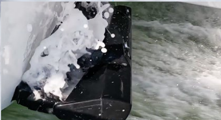
STANDARD SEAKEEPER RIDE