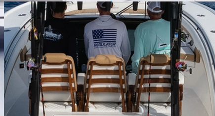
TEAK LADDER BACK CHAIRS