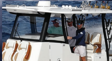
OPTIONAL BLACK POWDER COAT