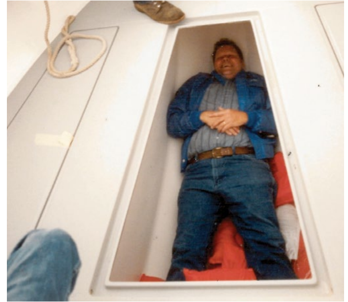
Testing out the in-deck fishbox