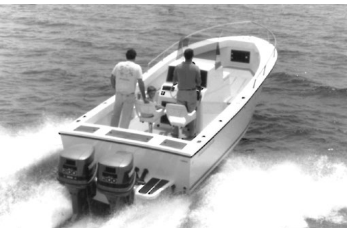
Testing the ride of the first Regulator 26