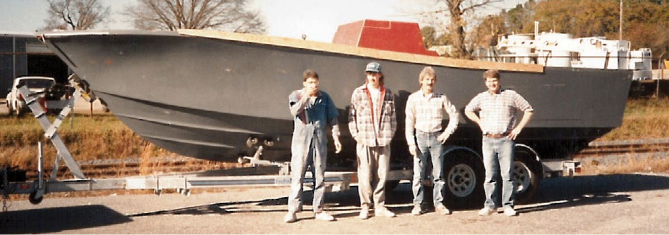
The team of boatbuilders and friends who made that first boat a reality